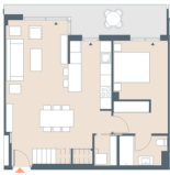
OPCIÓN COCINA PREMIUM 'opcional con coste