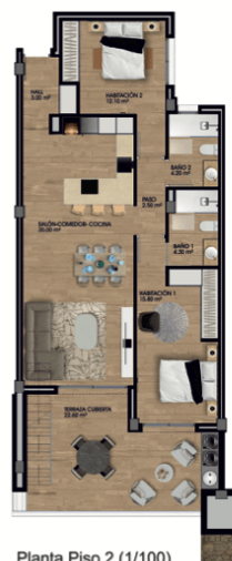
Planta Piso 2 (1/100)