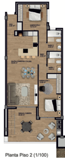
Planta Piso 2 (1/100)