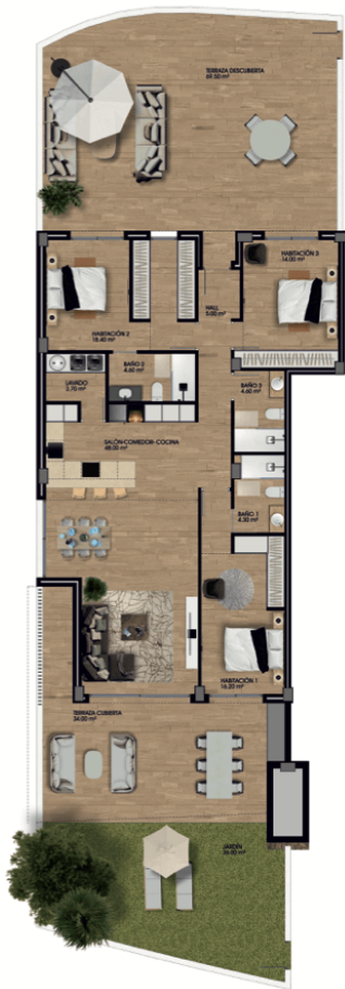
Planta Baja (1/100)