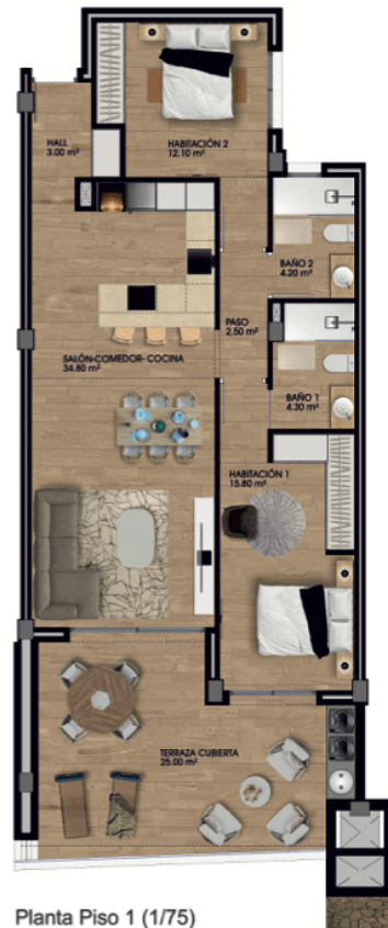
Planta Piso 1 (1/75)