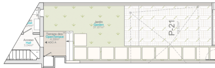
Planta baja | Ground Floor