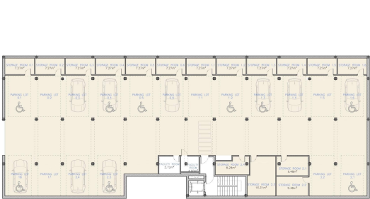
PRICE LIST 28/08/2024