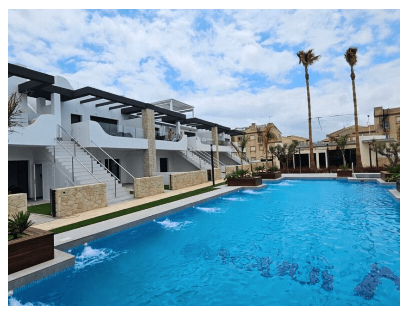
Pilar de la Horadada