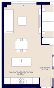
Opcional cocina con coste