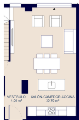
Opcional cocina con coste