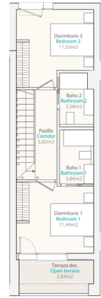
Planta Alta | Top Floor