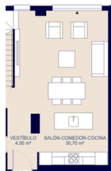
Opcional cocina con coste