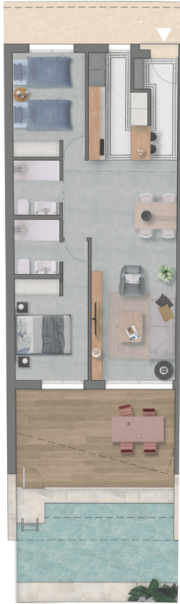
Planta baja / Ground Floor