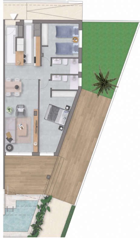
Planta baja / Ground Floor