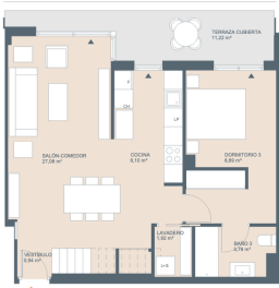
Planta terraza (nivel inferior)