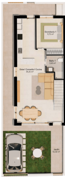
PLANTA BAJA GROUND FLOOR