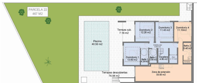
SUPERFICIE CONSTRUIDA PLANTA BAJA: 123,52 m2