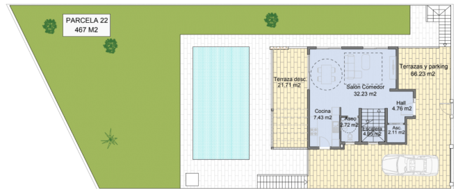
SUPERFICIE CONSTRUIDA PLANTA ACCESO: 62,10 m2 SUPERFICIE CONSTRUIDA DE TERRAZAS Y PARKING: 87,94 m2