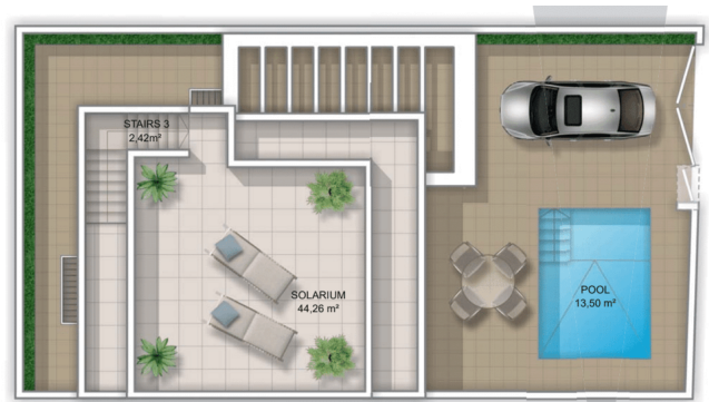
PLOT SURFACE 185,86 m²