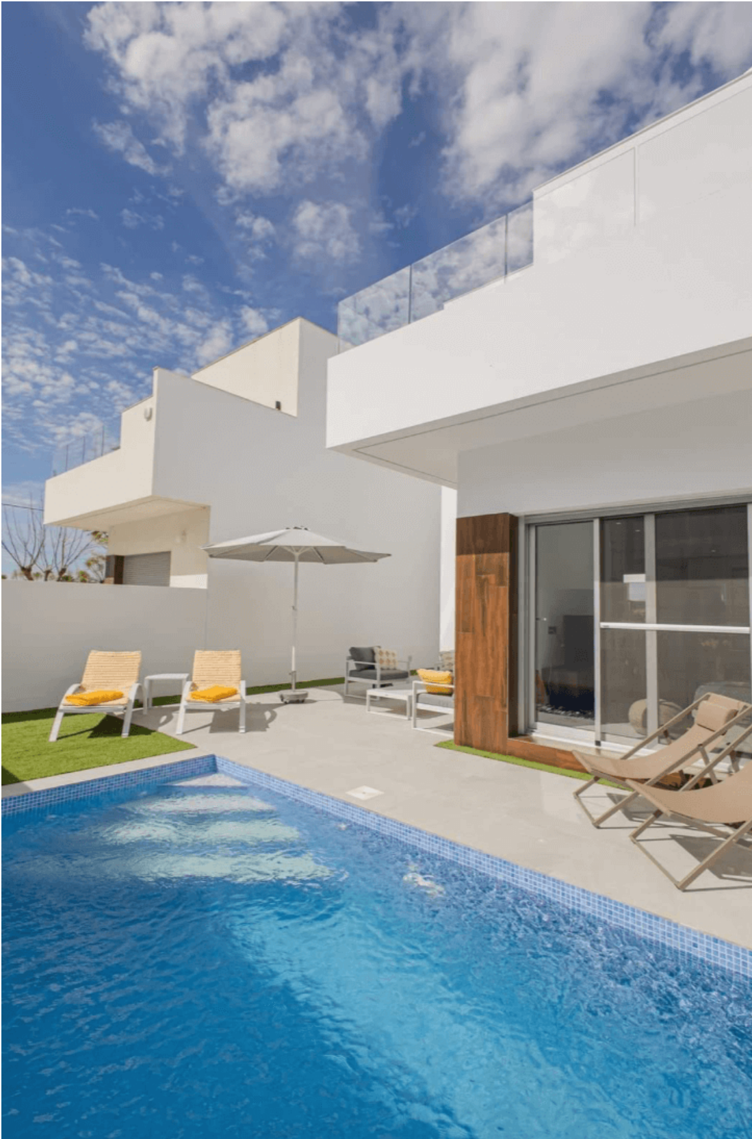
San Fulgencio Villa with private pool