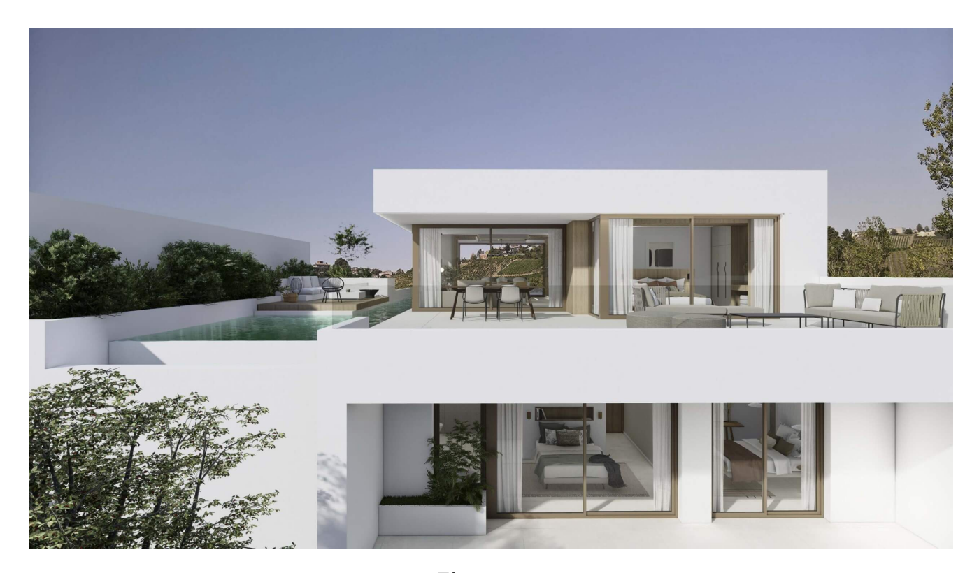
Finestrat Villa with sea and mountain views